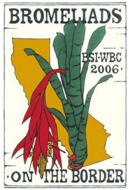
WBC 2006 San Diego: Did you attend?

This month we'll spend some time looking back at the World Bromeliad Conference held here in 2006. It's a good way to get in tune and ready for this year's conference here. We got a copy of the file from the BSI as a special favor. It may be a bit of an eye-opener to some. However, I think you'll enjoy it.