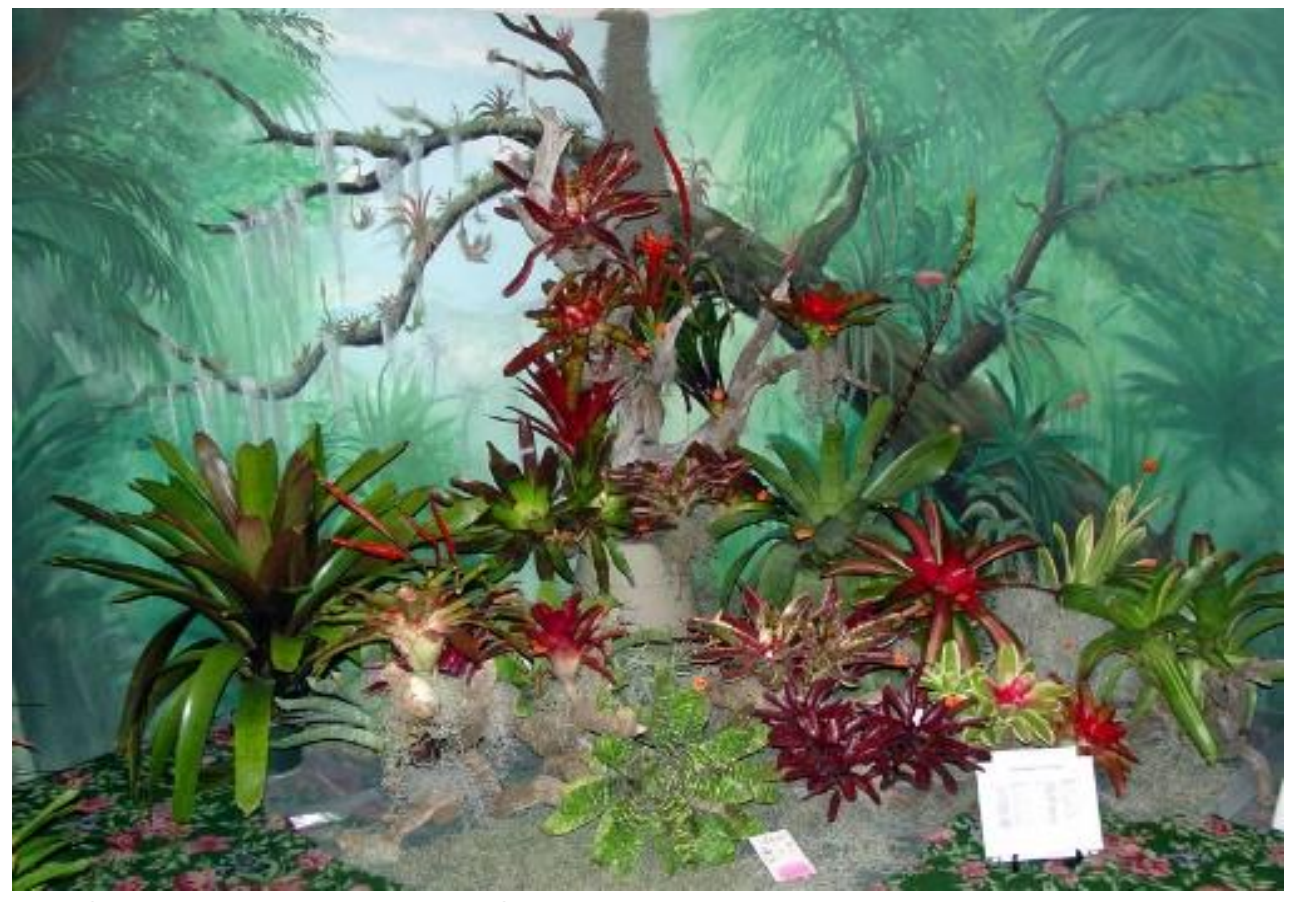
One of the displays in the 2006 world conference. Anybody remembers who created this one?